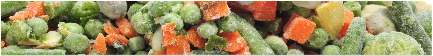
Table Top Freezer